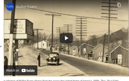
A selection of Walker Evans photos from the across the United States of America, 1930s. The J. Paul Getty Museum, Los Angeles

/// What do I want to do?... I know now is the time for picture books. An American city is the best, Pittsburgh better than Washington. I know more about such a place....<sup>2</sup>